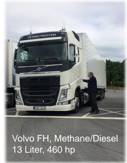
Volvo FH, Methane/Diesel 13 Liter, 460 hp

Iveco: They have introduced Stralis NP, 400 hp in Europe.