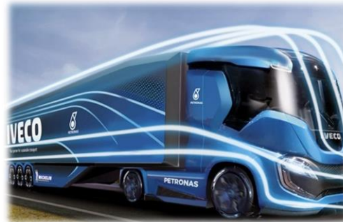
Iveco premieres new Z TRUCK powered by biomethane at IAA 2016 460 hp, range 2200 km