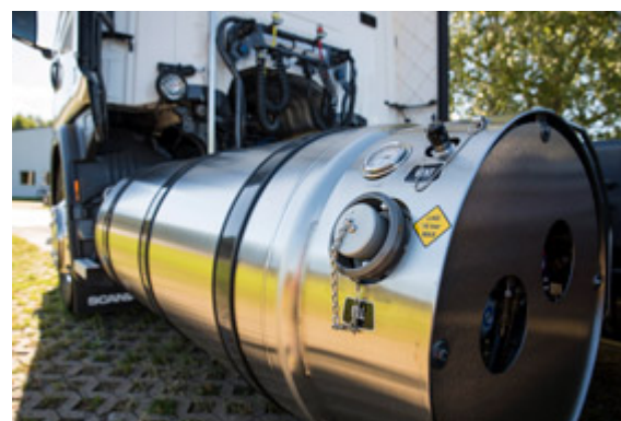
New Scania LNG truck

Release date: 8 November 2017 Power output: 410 hp