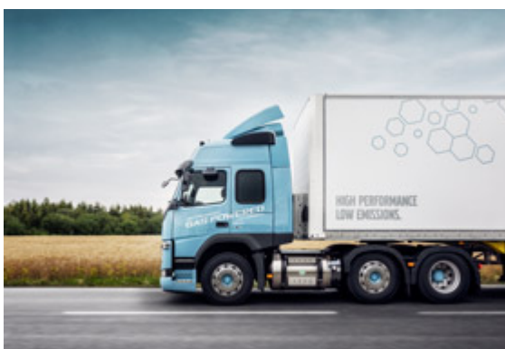
New Volvo LNG truck

Did you know that on the Swedish fast chargers installed in GREAT are equipped with credit card readers? This payment method complements the RFID tags, app and other methods to make payment easy for any customer.